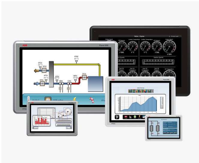
ABB Ability™ Symphony® Plus Hardware Selector

The Panel 800 family comprises user-friendly, intuitive, and ergonomic operator panels that combine slim, space-saving dimensions with a comprehensive range of advanced functions. Designed to make process automation easy, all panels are equipped with touchscreen operation with advanced functionality for process and equipment control.